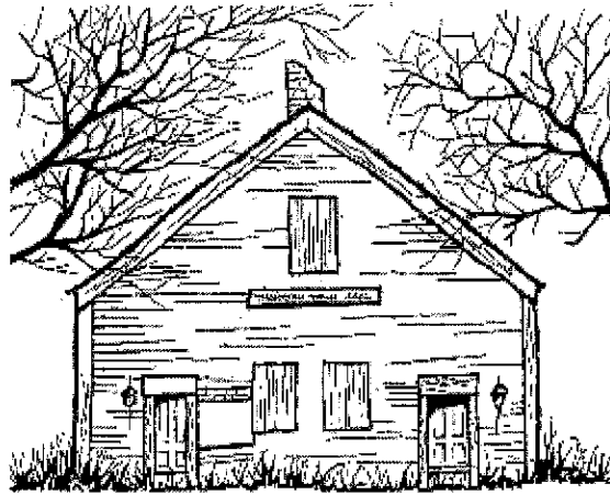
Thornton meetinghouse was erected in 1789